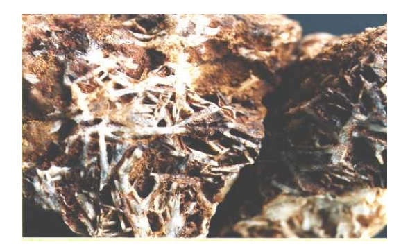
Photo 5. Quartz vein sample from Londeng River shows lattice texture indicating that boiling hydrothermal fluid forms the vein.

illite/sericite + pyrite + galena + chalcopyrite + sphalerite. The host (wall) rock of the vein is volcanic breccia which has been altered into a propylitic zone, very rich in very fine grains of pyrite + galena + chalcopyrite + sphalerite.