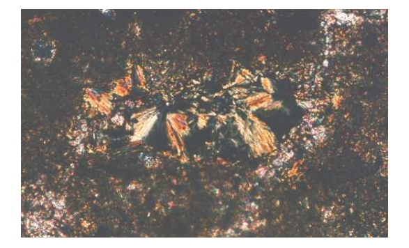
Photo 2. Photomicrograph of propylitic assemblage shows phenocrist chlorite and ore in a matrix built by very fine masses of chlorite and carbonate (Cross polarization, magnification 20x).