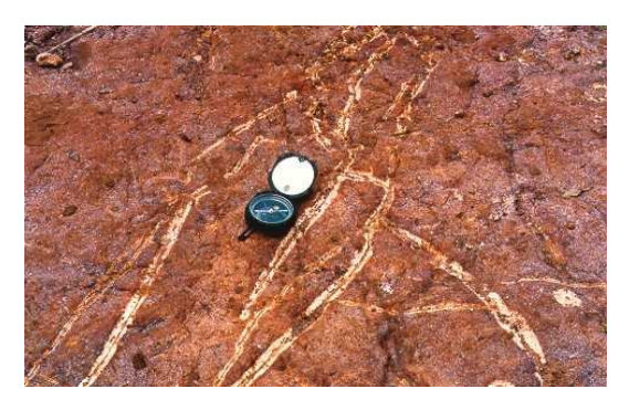
Photo 3. Stockwork built by calcite veins in very weathered (altered?) tuff of Gabon Formation at Dusun Domas.

Veinings in the studied area occur as individual vein and stockwork, filled by calcite (mainly) and quartz. A stockwork structure at Dusun Domas comprises braided thin veins within a very weathered and altered greenish red tuff. The veins are filled by calcite, relatively straight and variably 1 - 3 cm thick. At least two periods of vein filling with concentric pattern are noticeable (Photo 3).